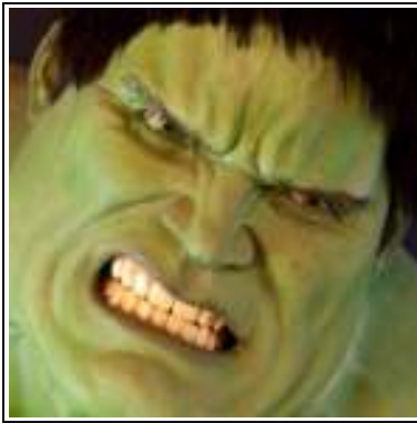
Why There's No More Hulk Till Avengers Sequel...