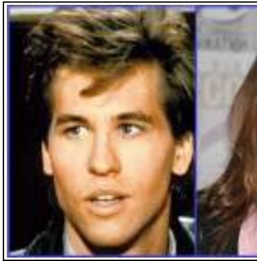
You Won't Believe How These Celebs Used To Look