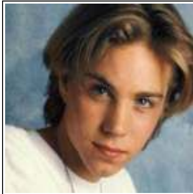
30 Child Actors Who Died Young