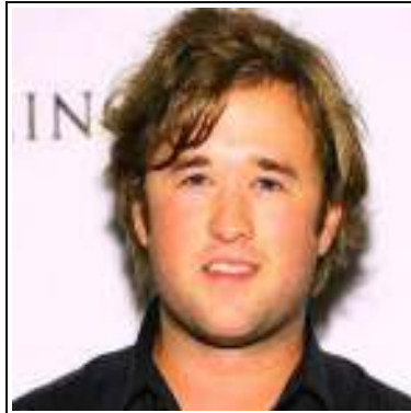
37 Child Actors Who Grew Up To Be Ugly