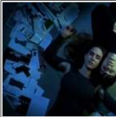
13 Movies That Are Too Powerful To Watch Again!