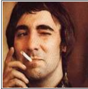
45 Celebrities Who Have Killed People